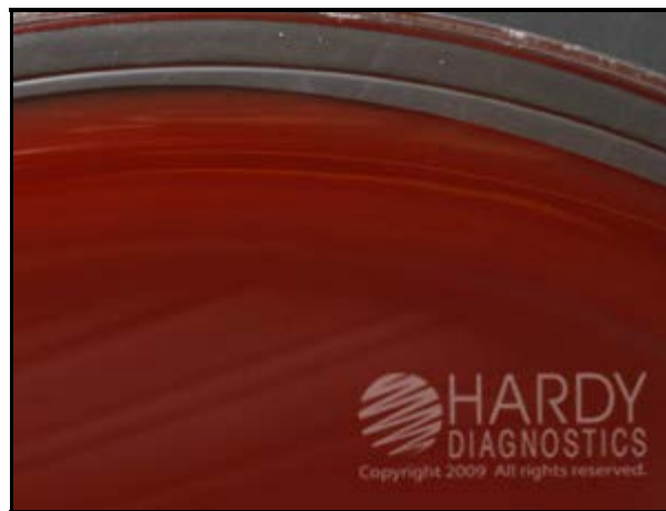
Proteus mirabilis (ATCC ® 12453) growth inhibited on Campy Cefex Agar, Modified (Cat. no. A122). Incubated aerobically for 48 hours at 35°C.