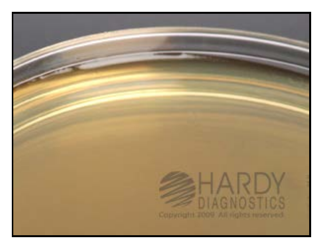
Sterile plate of BHI Agar (Cat. no. W15).

BHI Agar with Blood; BHI Agar with Blood and Gentamicin; and BHI Agar with Blood, Chloramphenicol, and Gentamicin should appear opaque, and cherry to brick-red in color.