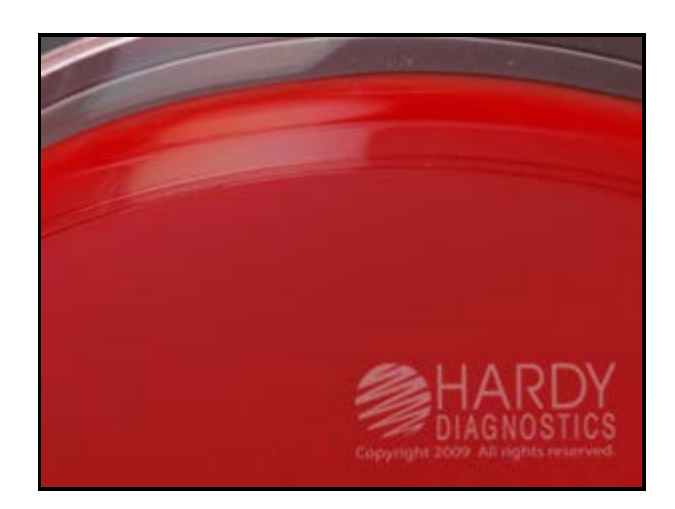
Uninoculated plate of BHI Agar with Blood (Cat. no. A20).