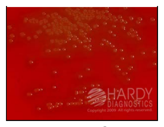
Streptococcus pneumoniae (ATCC <sup>®</sup> 6305) colonies growing on BHI Agar with Blood (Cat. no. A20). Incubated aerobically for 24 hours at 35°C.