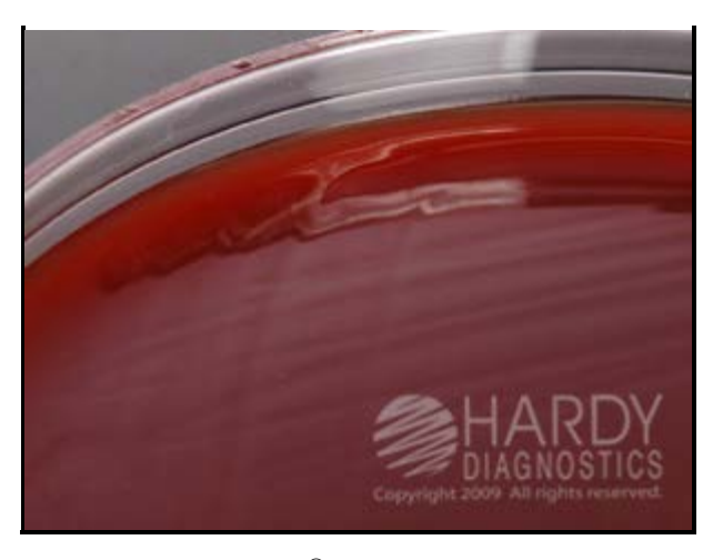
Escherichia coli (ATCC <sup>®</sup> 25922) growth inhibited on BHI Agar with Blood, Chloramphenicol and Gentamicin (Cat. no. W65). Incubated aerobically for 24 hours at 35°C.