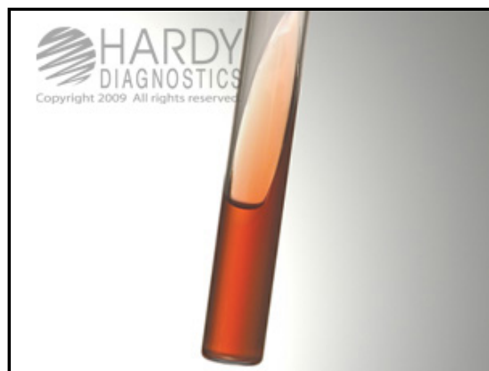
Uninoculated tube of TSI Agar (Cat. no. L50).