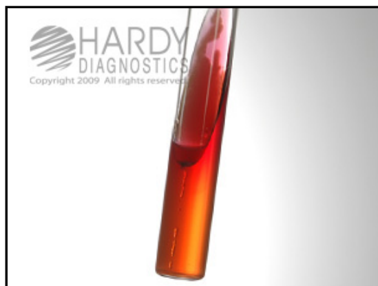
Pseudomonas aeruginosa (ATCC ® 27853) growing on TSI Agar (Cat. no. L50). Incubated aerobically for 24 hours at 35°C.