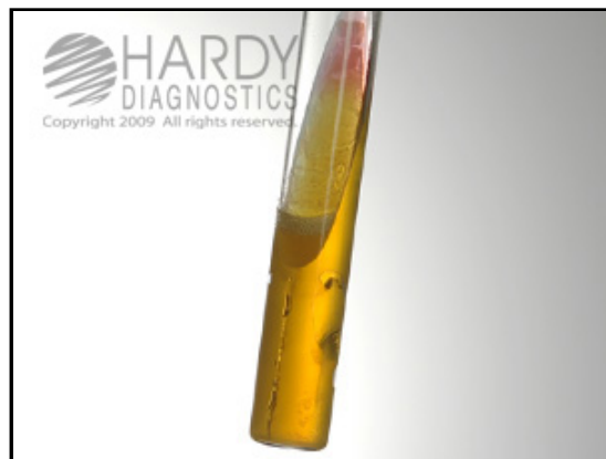
Escherichia coli (ATCC ® 25922) growing on TSI Agar (Cat. no. L50). Incubated aerobically for 24 hours at 35°C.