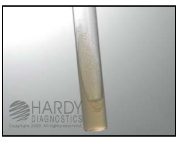
Mycobacterium intracellulare Group III (ATCC® 13950) colonies growing on Middlebrook 7H11 Agar (Cat. no. C36). Incubated in CO<sub>2</sub> for 21 days at 35°C