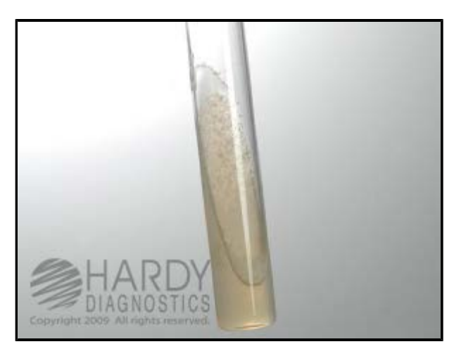
Mycobacterium kansasii Group I (ATCC® 12478)