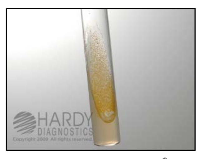
Mycobacterium scrofulaceum Group II (ATCC ^{\circledR} 19981) colonies growing on Middlebrook 7H11 Agar (Cat. no. C36). Incubated in CO _2 for 21 days at 35°C.