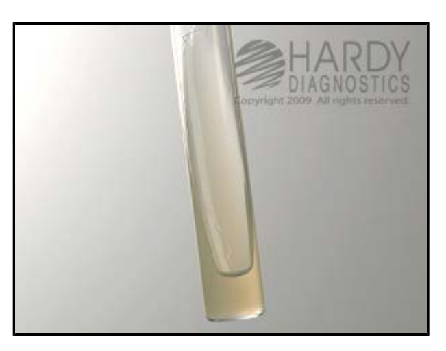
Uninoculated tube of Middlebrook 7H11 Agar (Cat. no. C36).