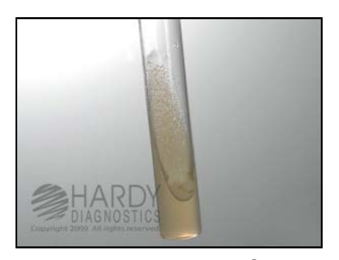
Mycobacterium fortuitum Group IV (ATCC ^{\otimes} 6841) colonies growing on Middlebrook 7H11 Agar (Cat. no. C36). Incubated in CO _2 for 21 days at 35°C.