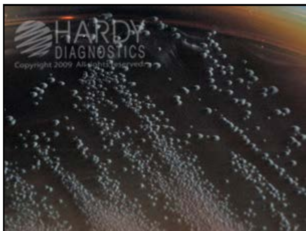
Bacteroides fragilis (ATCC® 25285) colonies growing on AnaeroGRO™ Bacteroides Bile Esculin Agar (Cat.

AnaeroGRO™ Bacteroides Bile Esculin (BBE) Agar should appear opalescent, and medium amber with blue tinge in color.