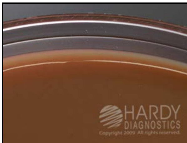
Staphylococcus epidermidis (ATCC ® 12228) growth inhibited on Chocolate Agar with Bacitracin (Cat. no. E11). Incubated aerobically for 24 hours at 35°C.