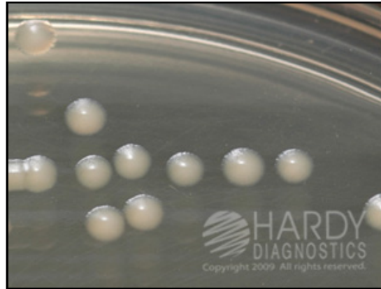
Escherichia coli (ATCC® 25922) colonies growing on TSA (Cat. no. G62). Incubate aerobically for 24 hours at 35°C.