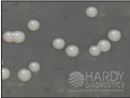
Staphylococcus aureus (ATCC® 25923) colonies growing on TSA (Cat. no. G62). Incubated aerobically for 24 hours at 35°C.