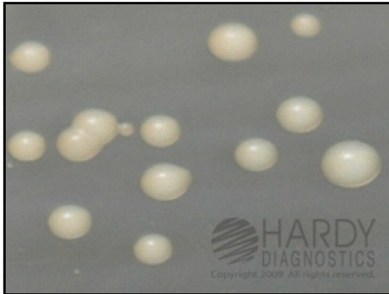
Candida albicans (ATCC® 10231) colonies growing on TSA (Cat. no. G62). Incubated aerobically for 48 hours at 35°C.