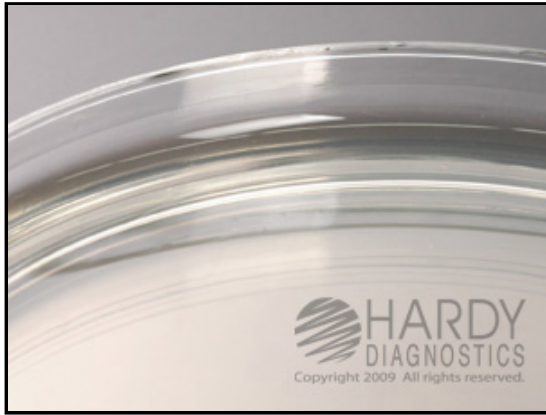
Uninoculated plate of TSA (Cat. no. G62).