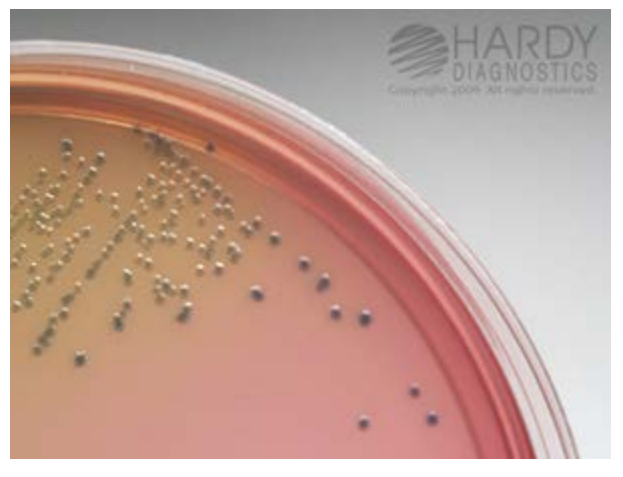
Hafnia alvei (ATCC ^{\circledR} 29926) colonies growing on HardyCHROM™ SS NoPro Agar (Cat. no. G327). Incubated aerobically for 24 hours at 35°C.