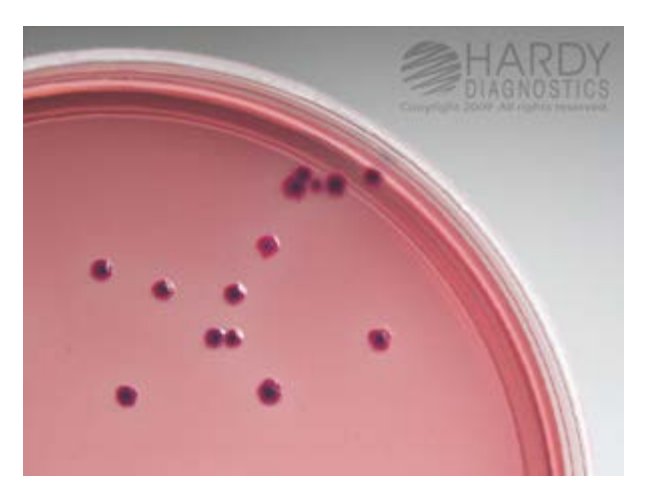
Escherichia coli (ATCC ^{\otimes} 25922) colonies growing on HardyCHROM™ SS NoPro Agar (Cat. no. G327). Incubated aerobically for 24 hours at 35°C.