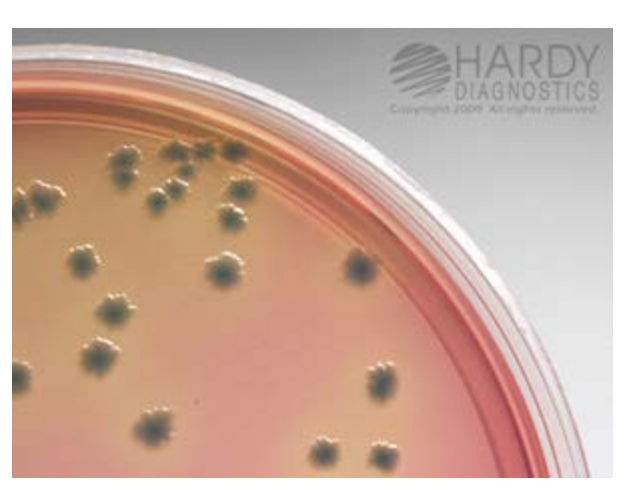
Shigella sonnei (ATCC ^{\circledR} 9290) colonies growing on HardyCHROM ^{\intercal} SS NoPro Agar (Cat. no. G327). Incubated aerobically for 24 hours at 35°C.