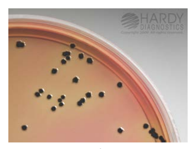
Salmonella enterica (ATCC ^{\circledR} 14028) colonies growing on HardyCHROM™ SS NoPro Agar (Cat. no. G327). Incubated aerobically for 24 hours at 35°C.

HardyCHROM<sup>TM</sup> SS NoPro Agar should appear clear, slightly opalescent, and dark pink in color