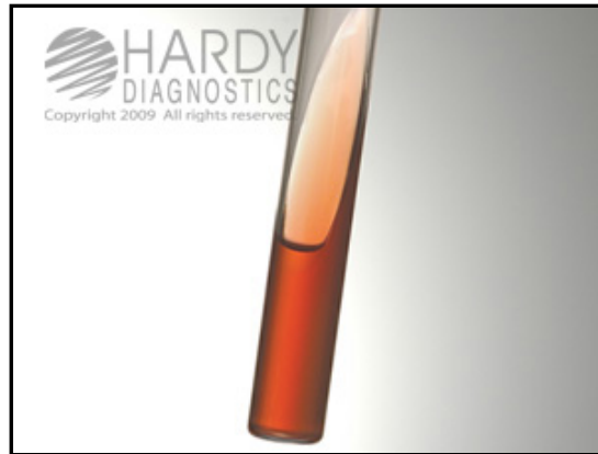
Uninoculated tube of TSI Agar (Cat. no. L50).