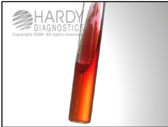
Pseudomonas aeruginosa (ATCC ® 27853) growing on TSI Agar (Cat. no. L50). Incubated aerobically for 24 hours at 35°C.