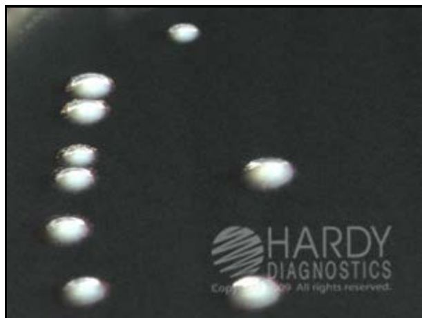
Legionella pneumophila (ATCC® 33152) colonies growing on BCYE Selective Agar (Cat no. G08). Incubated aerobically for 48 hours at 35°C.

All formulations of BCYE Agar listed should appear opaque, and black in color.