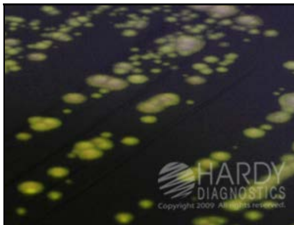
Legionella pneumophila (ATCC® 33152) colonies growing on BCYE Selective Agar (Cat. no. G08) under UV light. Incubated aerobically for 72 hours at 35°C.