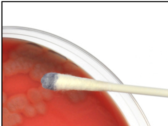
Pseudomonas aeruginosa (ATCC® 27853) applied to an OxiStick™ (Cat. no. Z193). The development of a