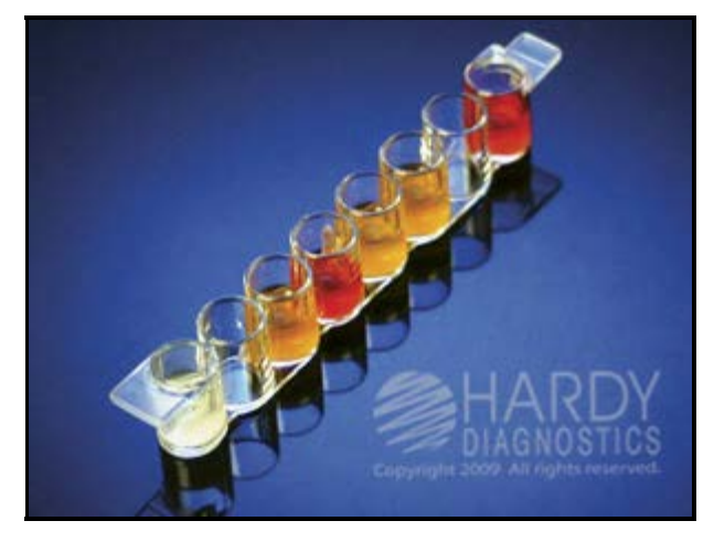
Showing results for Neisseria sicca (ATCC ^{\circledR} 9913) with the CarboFerm ^{\intercal} Neisseria Kit (Cat. no. Z98).