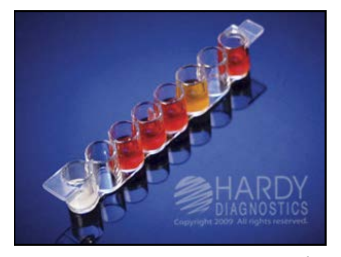
Showing results for Neisseria gonorrhoeae (ATCC ^{\circledR} 43069) with the CarboFerm<sup>TM</sup> Neisseria Kit (Cat. no. Z98).