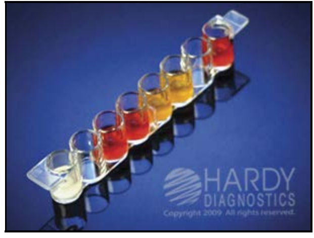
Showing results for Neisseria meningitidis (ATCC ^{\circledR} 13090) with the CarboFerm ^{\intercal} Neisseria Kit (Cat. no. Z98).