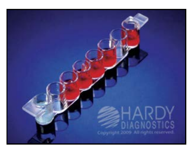
Showing results for Branhamella (Moraxella) catarrhalis (ATCC <sup>®</sup> 25240) with the CarboFerm™ Neisseria Kit (Cat. no. Z98). Note that the first well is blue.